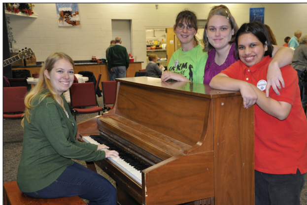
The Agape Club at Lexington Park UMC offers a monthly meal, fellowship and more to adults with special needs.