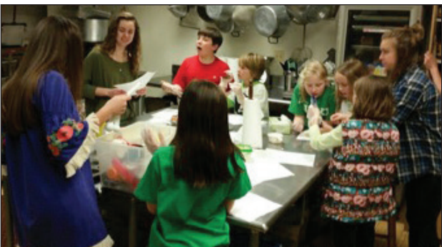
Youth from Mt. Harmony UMC cook Zimbabwean food as part of their learning about our partner Conference in Africa.