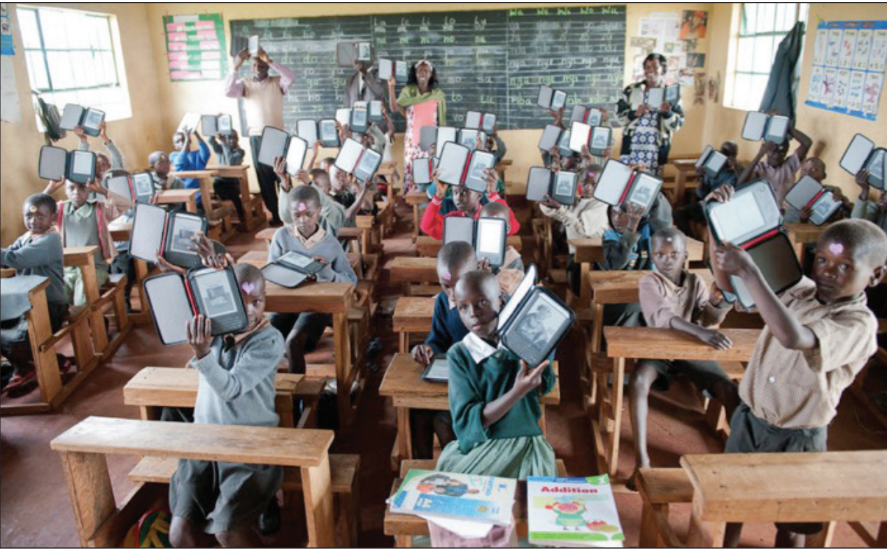
Students at the Murawe Mission School in Zimbabwe show off their e-readers, part of an effort to create a digital library.

ON SATURDAY, MAY 2, at 6:30 p. m., Grace UMC and the St. John's United Methodist Church Reconciling Cooperative Parish will host an opening for the "Shower of Stoles" exhibit at Grace UMC, 5407 North Charles Street, in Baltimore. The "Shower of Stoles" is an ecumenical project that has been in existence since 1995. It features stoles, which an ordained Elder would wear, made by or for a woman or man who has sensed a strong call to ordained ministry in their denomination, but who, because they are gay, lesbian, bisexual or transgendered, have been denied the opportunity to answer that call due to their denomination's policies. Accompanying each of the fifty stoles, which represent the larger collection, will be a laminated card containing the call story of the person whom the stole represents. The exhibit will also be open Sunday, May 3, following worship. For more information call the Grace UMC office at 410-433-6650.