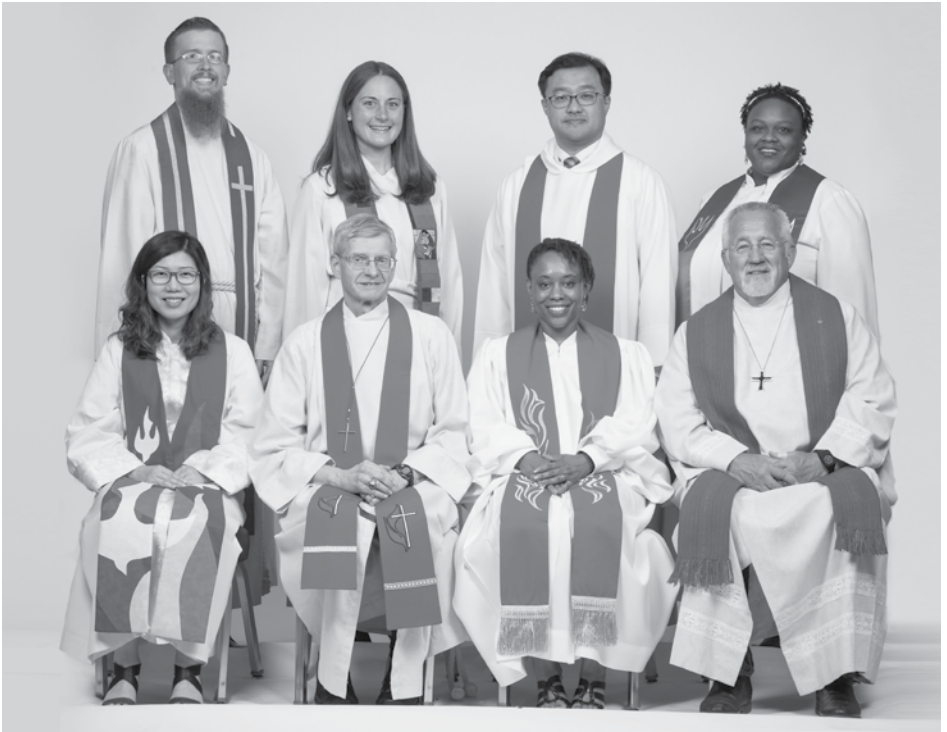
Ordination Class of 2017