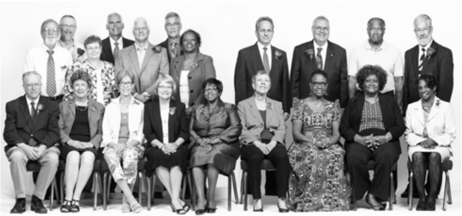
Retirees Class of 2017