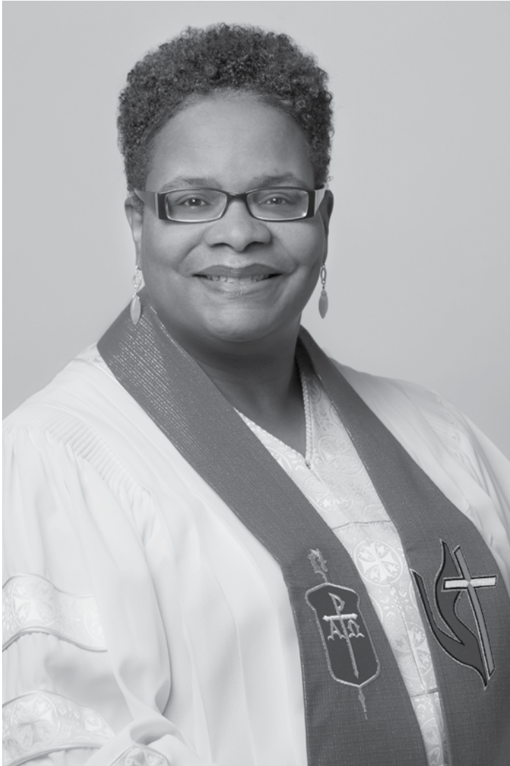
Bishop LaTrelle Easterling