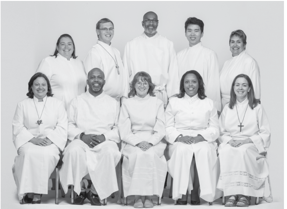
Commissioned Class of 2017