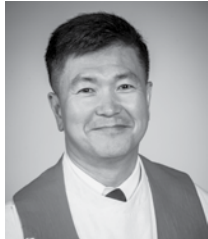
JW Park Central Maryland District