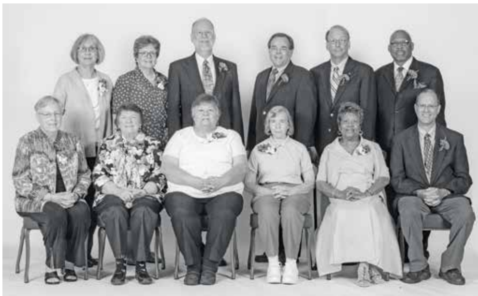
Retirees Class of 2015