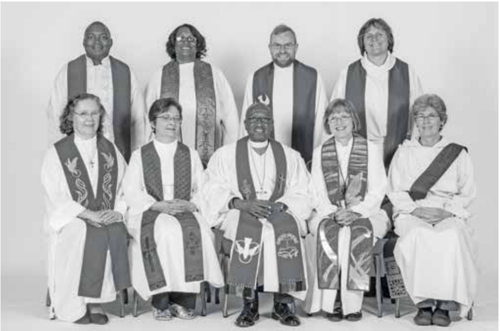
Ordination Class of 2015