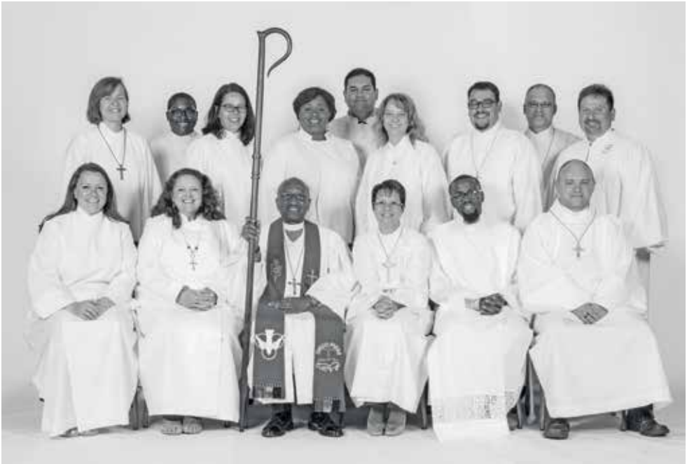
Commissioned Class of 2015